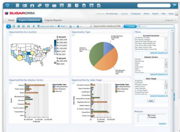
Access your Cognos Dashboards from within Sugar.